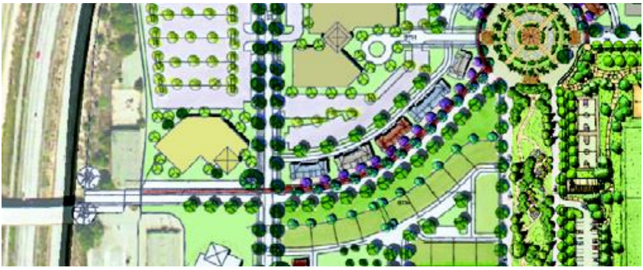
Dunes Specific Plan – Page 55 (corrected street name 2^{nd} Ave \rightarrow 1^{st} Ave):

Dunes Specific Plan – Page 23 – Excerpt: